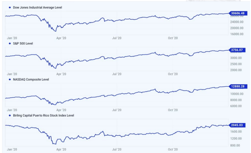
Birling Capital Puerto Rico Stock Index Returns, Jan 1 to December 31, 2020